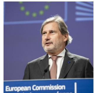
EU Commissioner Johannes Hahn

decision not to sign the agreement before consulting the parties concerned gave rise to some criticism, particularly in the German media. The risks highlighted ranged from simple sanctions (especially with regard to stock exchange equivalence) to Switzerland's isolation and a deterioration in its relations with the EU. The position of EU Commissioner Johannes Hahn in December emphasised those aspects and their importance in the press. Brexit was frequently covered, in particular with regard to a meeting in October between Federal Councillor Ignazio Cassis and the British Foreign Secretary Jeremy Hunt. According to the media, the UK's withdrawal from the EU might have the effect of hardening the EU's position towards Switzerland.