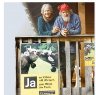
The horned cow initiative

population, some coverage criticised those behind the initiative, claiming they sought to impede international law and the economy. There were also mixed views about direct democracy and even Switzerland. But this image of a withdrawn Switzerland was then contradicted by the clear rejection of the initiative, which resonated well in the media and the positive implications were welcomed. The horned cow initiative, which was also widely covered, was the subject of less serious comments, for example how it was emblematic of Switzerland's identity. Topics such as direct democracy, tourism and Swiss products often associated with cattle were also covered.