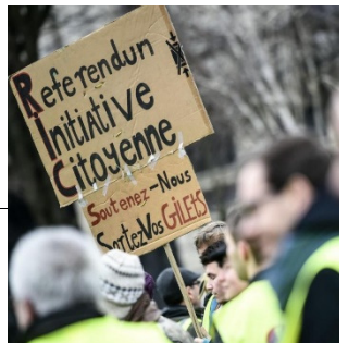
Gilets jaunes and referendum

Swiss direct democracy received a lot of coverage, especially in France and on social media, in the context of media reports on the gilets jaunes movement and the Citizens' Initiative Referendum. The French, German and Italian press (a similar debate is under way in Italy) discussed the Swiss political system in some detail, citing this as a model for citizen participation and expression. Direct democracy was also in the news in Switzerland itself, including certain shortcomings attributed to it by French politicians and academics (such as its manipulation by lobbyists) as well as the reactions, particularly in Switzerland and on social media, to those criticisms, which were portrayed as lacking understanding of what direct democracy in Switzerland actually is.