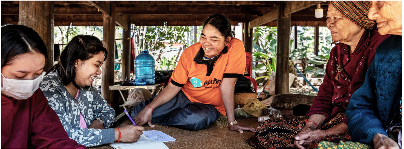
Villagers discussing community forestry as a response to the impact of COVID-19 on their livelihoods, Preah Vihear, Cambodia.

The Swiss Agency for Development and Cooperation (SDC) is Switzerland's international cooperation agency within the Federal Department of Foreign Affairs. In collaboration with other federal offices, the SDC is responsible for the overall coordination of development cooperation and humanitarian aid delivered by the Swiss Confederation.