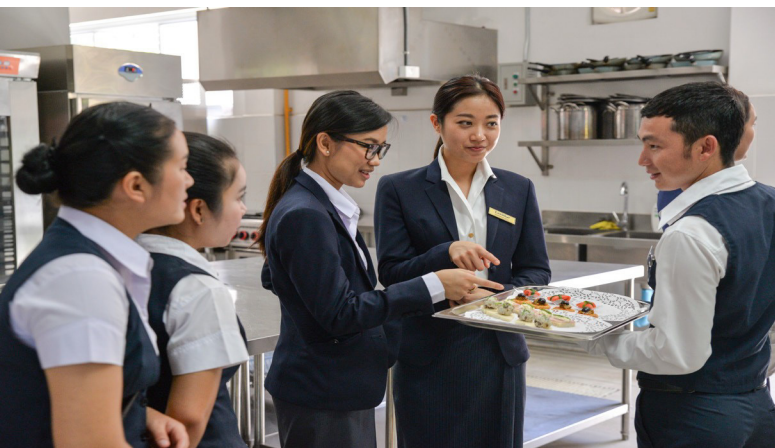
Skill for Tourism Food and Beverage Training Course in Vientiane Capital, Laos.

The IWGP supports water resource governance processes at the sub-national, national and regional levels in the Mekong region to be more inclusive of civil society, women and marginalised social groups. This shall ultimately lead to more sustainable livelihoods of riparian communities through access to river resources and the environmental services they provide. Through this project, Switzerland will support civil society organisations, women and vulnerable communities to better influence water resource governance and decision-making processes at all levels in the Mekong region.