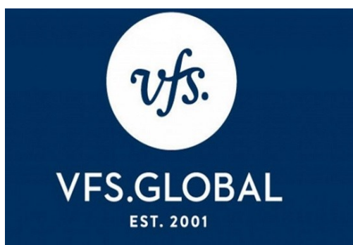
VFS Global Logo

VFS, the official visa outsourcing partner of the Swiss Embassy in Ghana has moved its offices in June 2019 to a new location. The Visa Application Centre can now be found on the 1st floor of the Atlantic Towers, behind Marina Mall, Airport City, Accra.