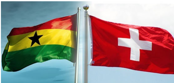
Flags of Ghana and Switzerland