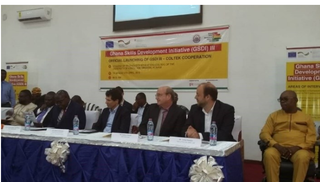
Participants at the launch

On April 4, the College of Technology Education (CoLTEK) of the University of Education, Winneba (UEW) and the Ghana Skills Development Initiative (GSDI III), which is co-financed by Switzerland under its Ghana Private Sector Competitiveness Program (GPSCP) officially launched their cooperation in a festive ceremony.