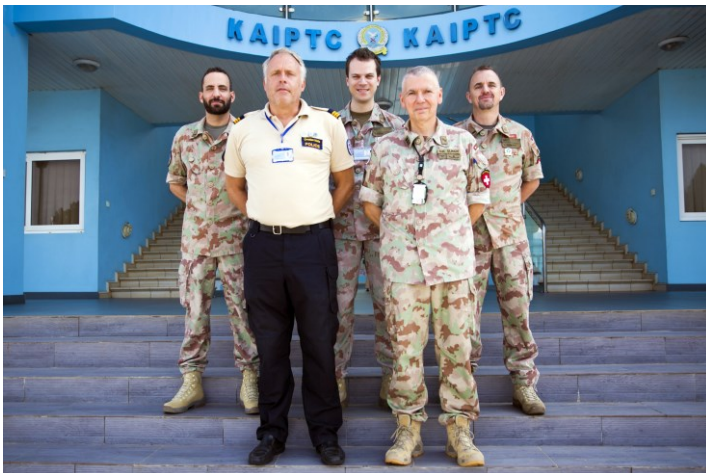
Swiss personnel at the center

The Kofi Annan International Peacekeeping Training Centre (KAIPTC) is a competence centre for civil and military peacekeeping, and conducts research and offers training programmes to that serve that purpose. Since 2003, KAIPTC has held more than 170 courses covering a wide variety of peacekeeping topics. Switzerland supports the KAIPTC in Teshie (Accra) by providing a team of five well-trained Swiss staff devoted to make the Center’s mission theirs. Here below, members of the team present a short overview of their responsibilities and