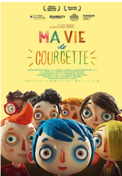
Film poster © RITA, Blue Spirit Productions and Gébéka Films

Every year, French speaking populations, present in more than 88 countries all over the world, celebrate la Francophonie on the 20th of March. In Accra, “La Semaine de la Francophonie”, held between the 16 th and 23 rd of March 2019, to recall its core values, which are the promotion of the French language and further cultural and linguistic plurality. A number of events were organized by the Francophone embassies, including Switzerland, in collaboration with the Alliance Française.