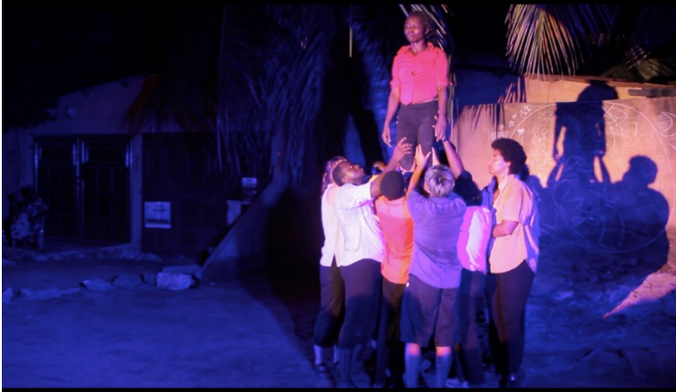
Twelve young people from Lomé and Berlin participated in the play

The first representations of a theatrical project supported through a contribution of the Embassy of Switzerland took place in Lomé on 7 and 8 March 2019. Both performances attracted a large audience and received a positive response of the public.