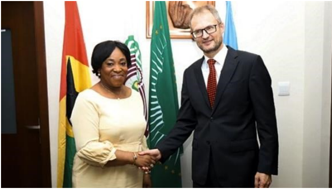
Meeting between Ambassador Stalder and Hon. Shirley Ayorkor Botchway on the 13 th of May

On May 13, Mr. Philipp Stalder, Switzerland's Ambassador-designate to Ghana met the Minister of Foreign Affairs and Regional Integration Hon. Shirley Ayorkor Botchway in Accra to present his open letters.