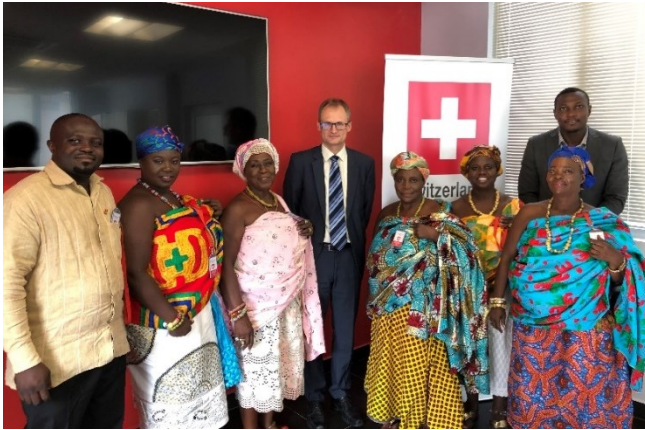
Ambassador Stalder, with the delegation

On June 13, Ambassador Philipp Stalder hosted a delegation from the Queen Mothers' Foundation of Ghana. The six-member delegation paid a courtesy call on Ambassador Stalder and took the opportunity to inform him of activities lined-up in celebration of the group's 20 th Anniversary.