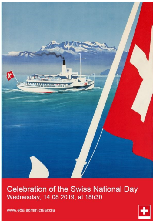
Artwork of Zürichsee

Die Schweizer Botschaft feiert am Mittwoch, 14. August 2019, den diesjährigen Schweizer Nationalfeiertag. Wie in den Vorjahren wird die Botschaft in der Schweizer Residenz einen Empfang abhalten und Schweizer Staatsbürger, Mitglieder der Diplomatengemeinschaft und Vertreter der Regierung empfangen. Alle auf der Botschaft registrierten Schweizer Bürger Ghanas sind herzlich zum Nationalfeiertag eingeladen und haben eine elektronische Einladung erhalten.