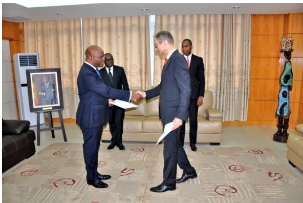
Poignée de main entre l'Ambassadeur Philipp Stalder et SEM Auréliem Agbénonci.

Le nouvel ambassadeur agréé de la Suisse auprès de la République Bénin, M. Philipp Stalder, a présenté le 31 mai 2019 les copies figurées de ses lettres de créance auprès du ministre béninois des Affaires Etrangères, M. Auréliem Agbénonci. Suite à la séance protocolaire, l'Ambassadeur Stalder s'est brièvement entretenu avec le Ministre.