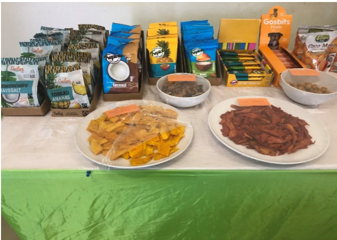
Some products of HPW Fresh and Dry