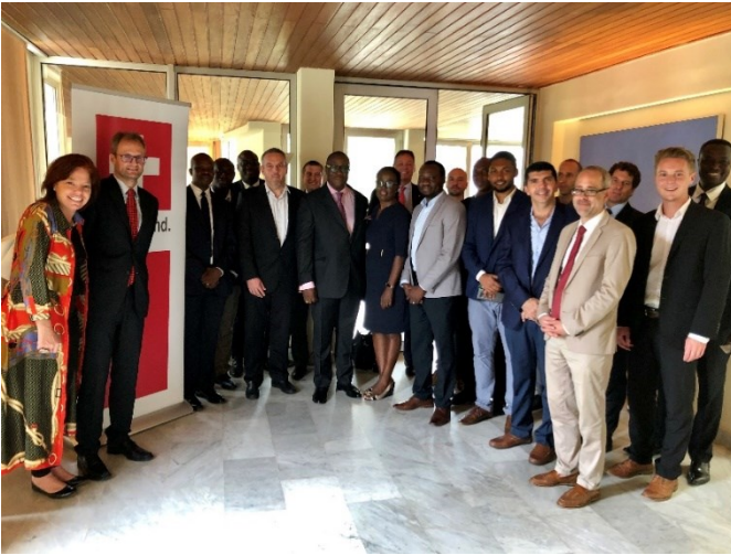
Participants of the informal business lunch