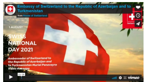
Video message – ambassador's greetings on the occasion of the Swiss National Day (1 August)