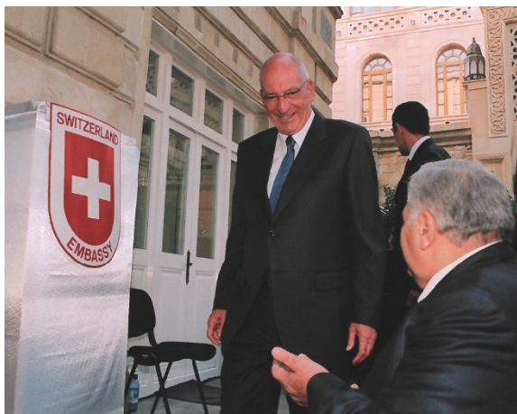
President Pascal Couchepin inaugurating the Embassy in Icheri Sheher on 12 May 2008

This year, the date of 1 August – Swiss National Day –, will have a very special significance for the Embassy of Switzerland in Baku. On that date, our Embassy will move to new premises, located at 96E Nizami Street (Landmark I building).