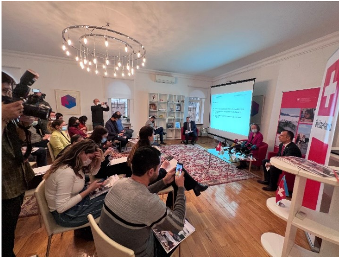
Press event at the Swiss Residence, 13 December 2021