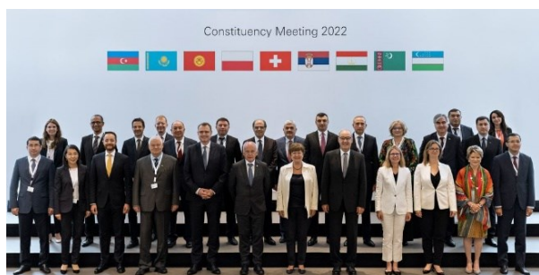
Participants at the Constituency meeting in Bad Ragaz, 4 July 2022

At Switzerland's invitation, a meeting of the members of the Swiss constituency in the Bretton Woods institutions, i.e. International Monetary Fund and World Bank, took place in Bad Ragaz (canton of St. Gallen) on 4 July 2022.