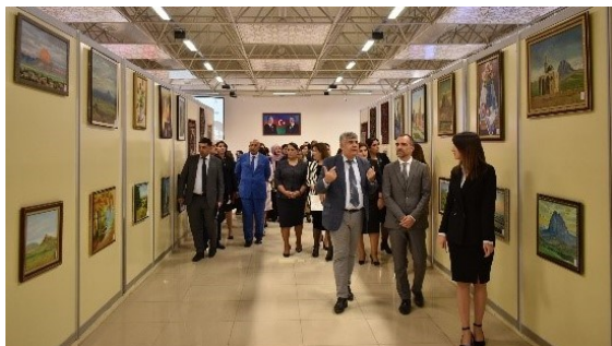
Project visit in the Nakhchivan Autonomous Republic, 1 March 2022

Representatives of the Swiss Cooperation Office, which is part of the Swiss Embassy in Baku, attended the launch of a project in the field of women's economic empowerment in Nakhchivan on 1 March 2022.