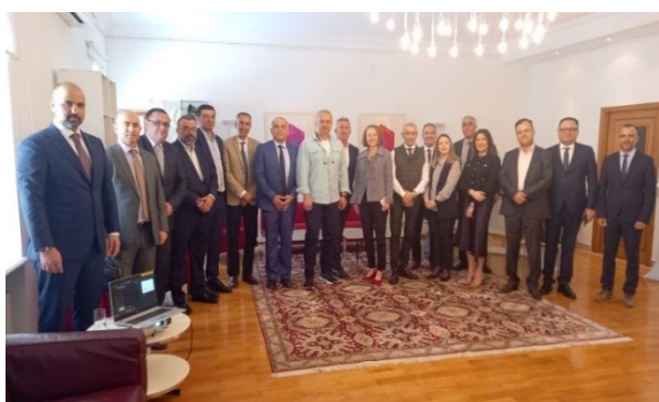
Participants at the Swiss business lunch, 5 May 2022