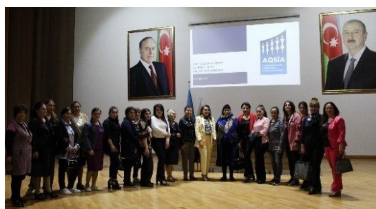
Conference in Zaqatala, 25 May 2022

These projects are funded by the Swiss Agency for Development and Cooperation (SDC). The Swiss Cooperation Office is planning to issue the next call for proposals for new project ideas in the second half of 2022. The call will be published on the Embassy's website and Facebook page: Swiss Embassy on Facebook