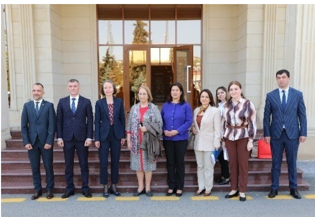
Participants at the visit to Gusar, 26 April 2022