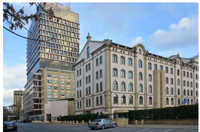
The Landmark complex

The opening hours of the Embassy and of its visa section will not change (see website ). However, due to relocation works, the Embassy will be closed to the public from 28 July to 2 August 2022.